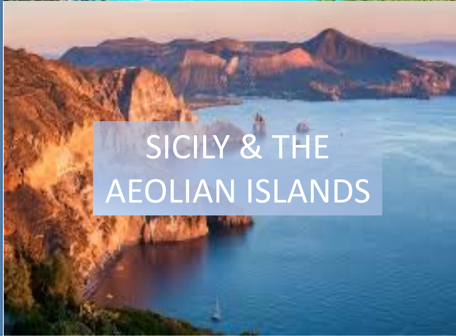
SICILY & THE AEOLIAN ISLANDS