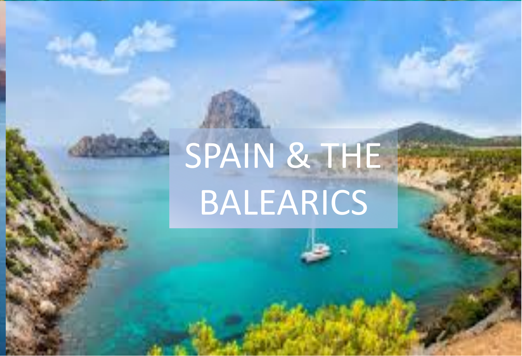
SPAIN & THE BALEARICS